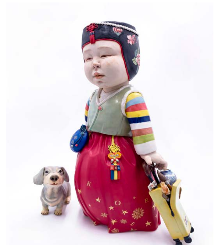
Kyungmin Park. Jan 6, 2006. Stoneware, underglaze, glaze, resin, paint. 19.5 x 13 x 13 inches