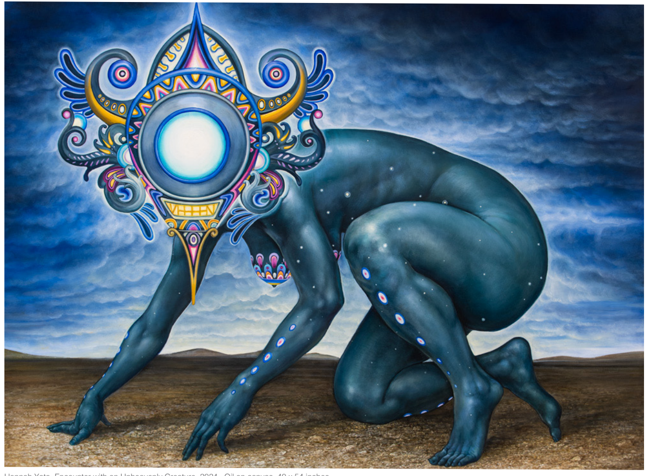
Hannah Yata. Encounter with an Unheavenly Creature, 2024. Oil on canvas. 40 x 54 inches

Hannah Yata utilizes the intricate technique of great masters in her all-consuming paintings, transporting viewers to her world of whimsy and play. Yata's paintings serve as a personal narrative, exploring themes of female empowerment, spirituality, and ecological transformation. Bold and confrontational, her figures and nature-inspired psychedelic language take viewers on a journey, encouraging them to perceive the world through a fresh perspective. Yata skillfully manipulates mythical and feminine motifs as extensions of nature, prompting contemplation of the reality or surreality inherent in the stories that shape our existence. Her colossal female forms initiate us into their world and play in the realm of both the material and spiritual.