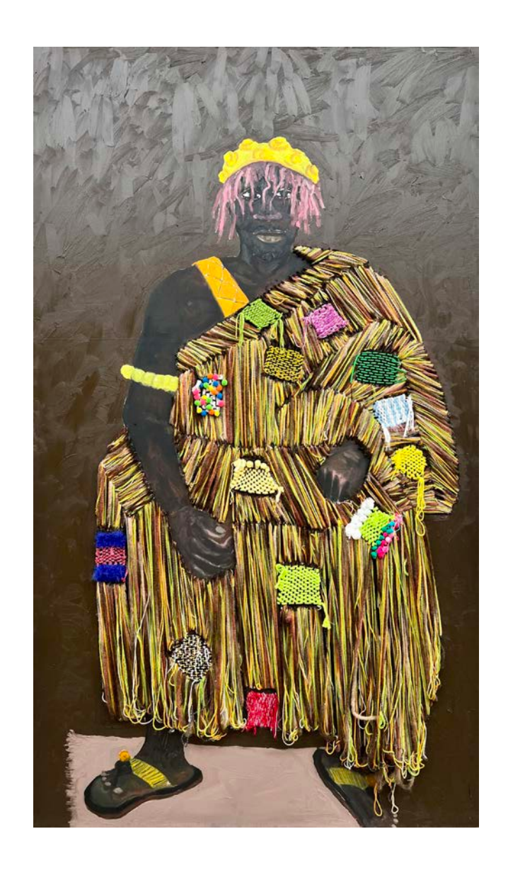
Frank Coffie Ewe King, 2023 Oil, yarn, and beads on canvas 84 x 48 inches