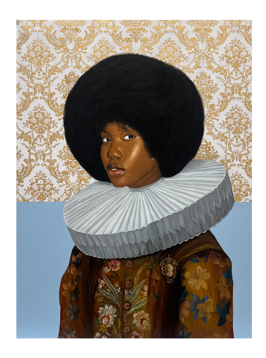
Kelani Fatai Oladimeji Faizal "Young and Demure II," 2024 Oil and acrylic on canvas 40 x 30 inches