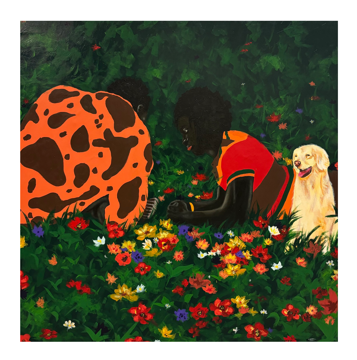
Olasunkanmi Akomolehin The Old Times (iii), 2024 Oil and acrylic on canvas 48 x 48 inches