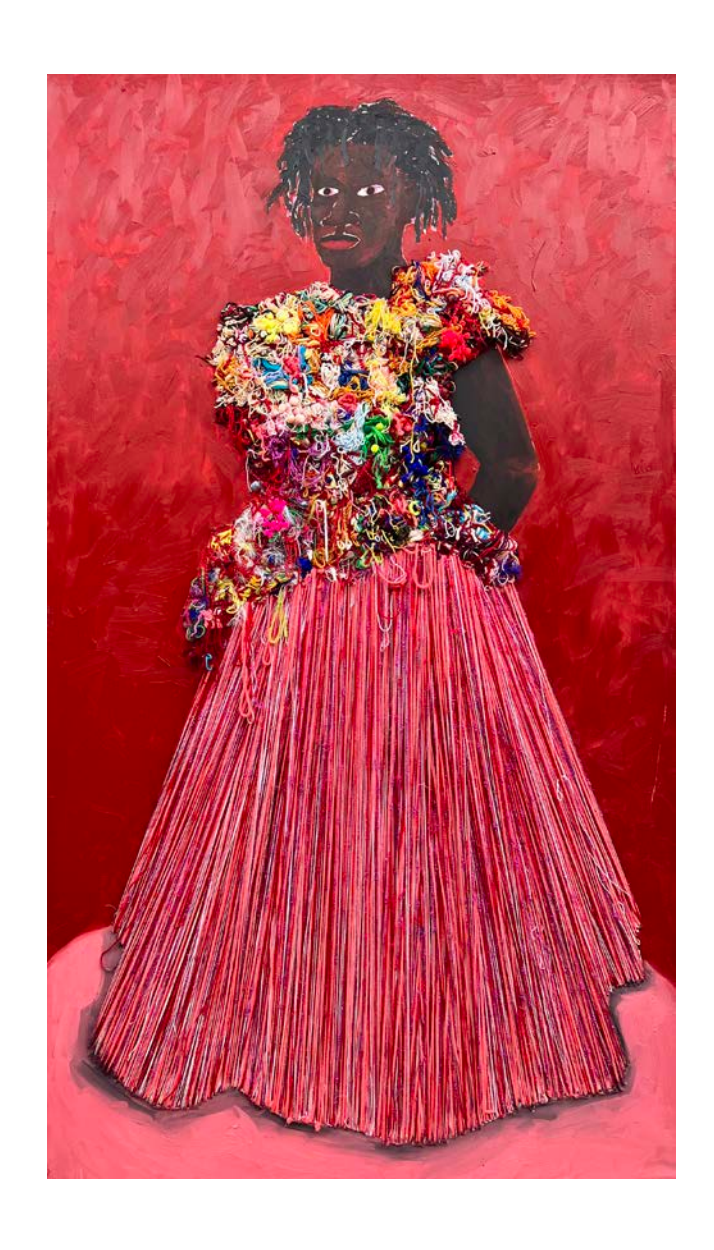
Frank Coffie Lady in Red, 2022 Oil and yarn on canvas 84 x 48 inches