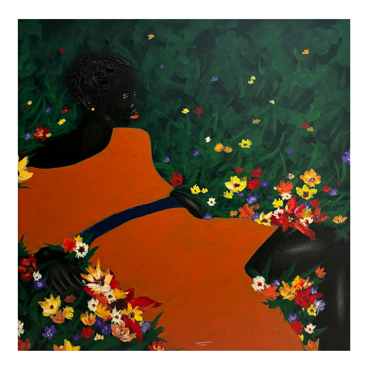
Olasunkanmi Akomolehin Girl with a Yellow Earring (I), 2024 Oil and acrylic on canvas 31 x 31 inches