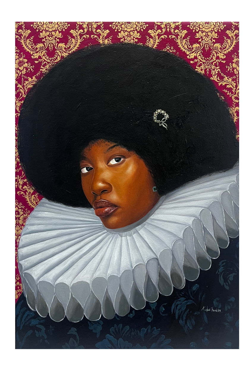
Kelani Fatai Oladimeji Shade "Sunflower Beauty," 2024 Oil and acrylic on canvas 35 x 24 inches