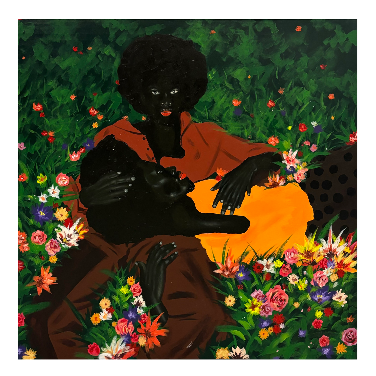
Olasunkanmi Akomolehin A Moment with Lucy, 2024 Oil and acrylic on canvas 50 x 50 inches