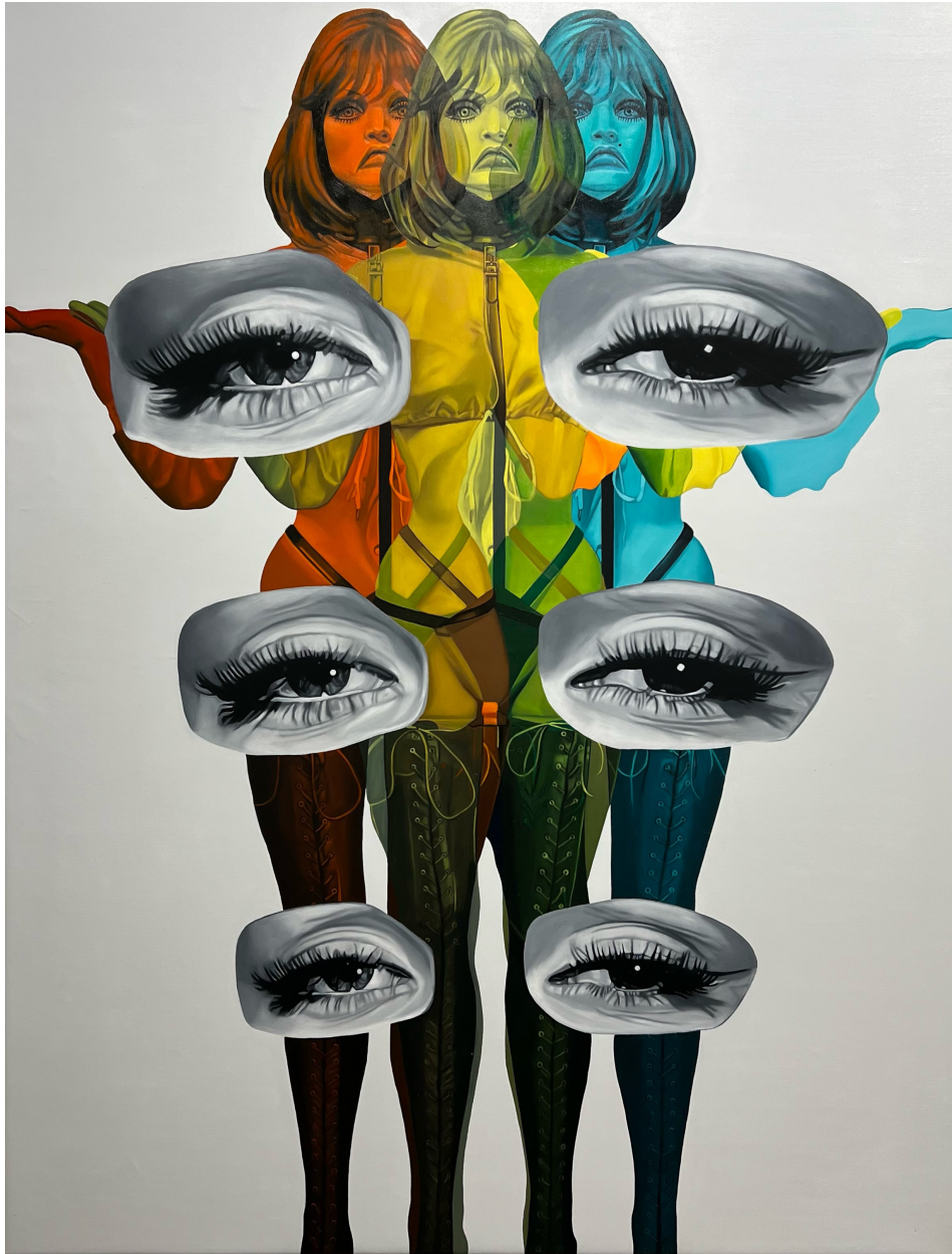
Teiji Hayama Hat Stand, 2024 Oil on canvas 63 x 47 inches