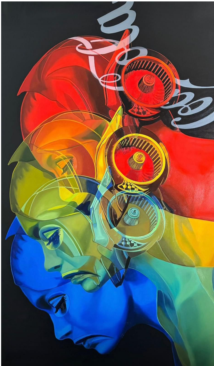
Teiji Hayama Coke Heads, 2024 Oil on canvas 52.25 x 35.5 inches