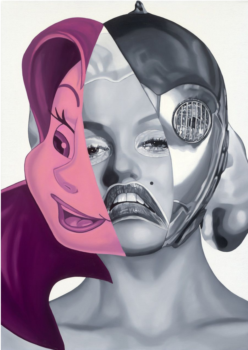
Teiji Hayama 3 Emotions II, 2024 Oil on canvas 41.5 x 29.5 inches