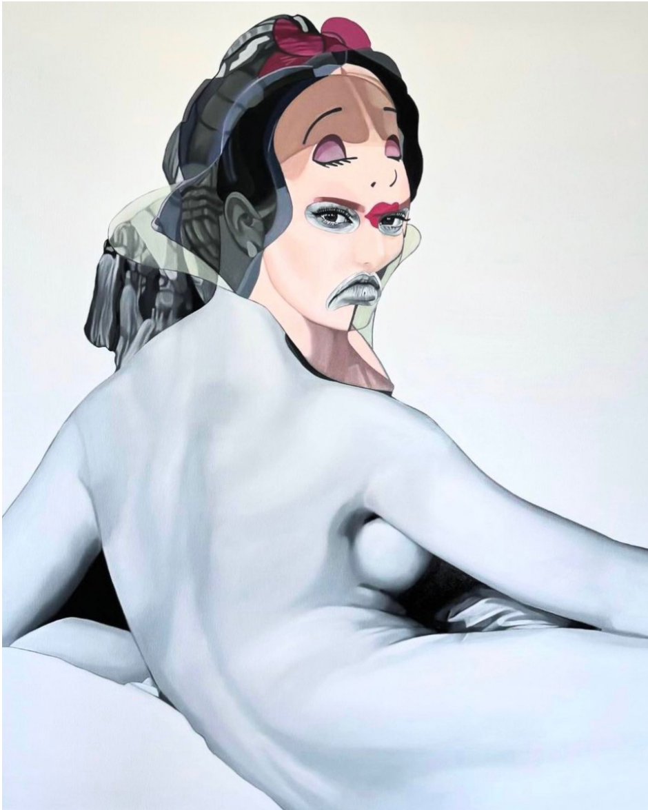
Teiji Hayama The Bath, 2024 Oil on canvas 43.5 x 35.5 inches