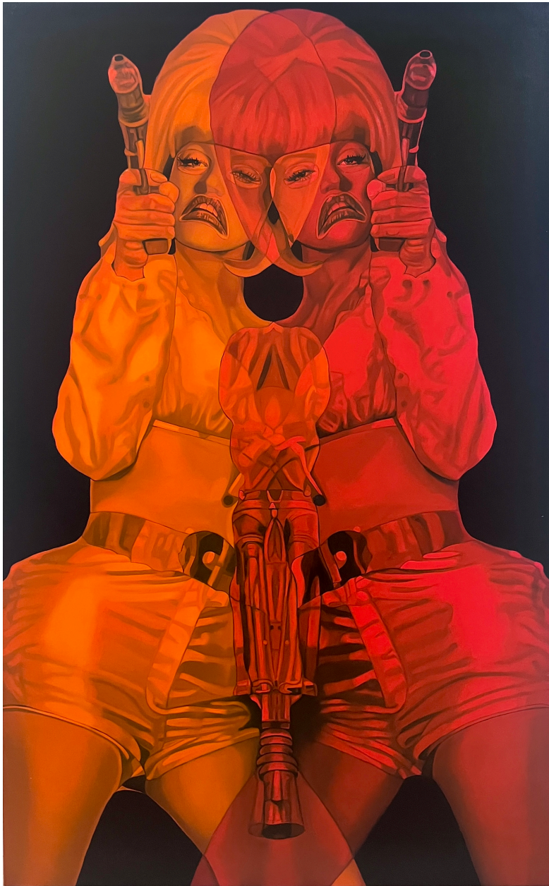
Teiji Hayama Spacegun Marilyn, 2024 Oil on canvas 53.25 x 33.25 inches