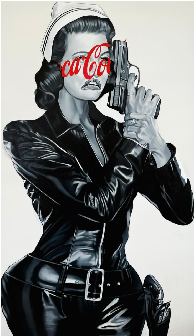
Teiji Hayama Cola Nurse, 2024 Oil on canvas 47.5 x 29 inches