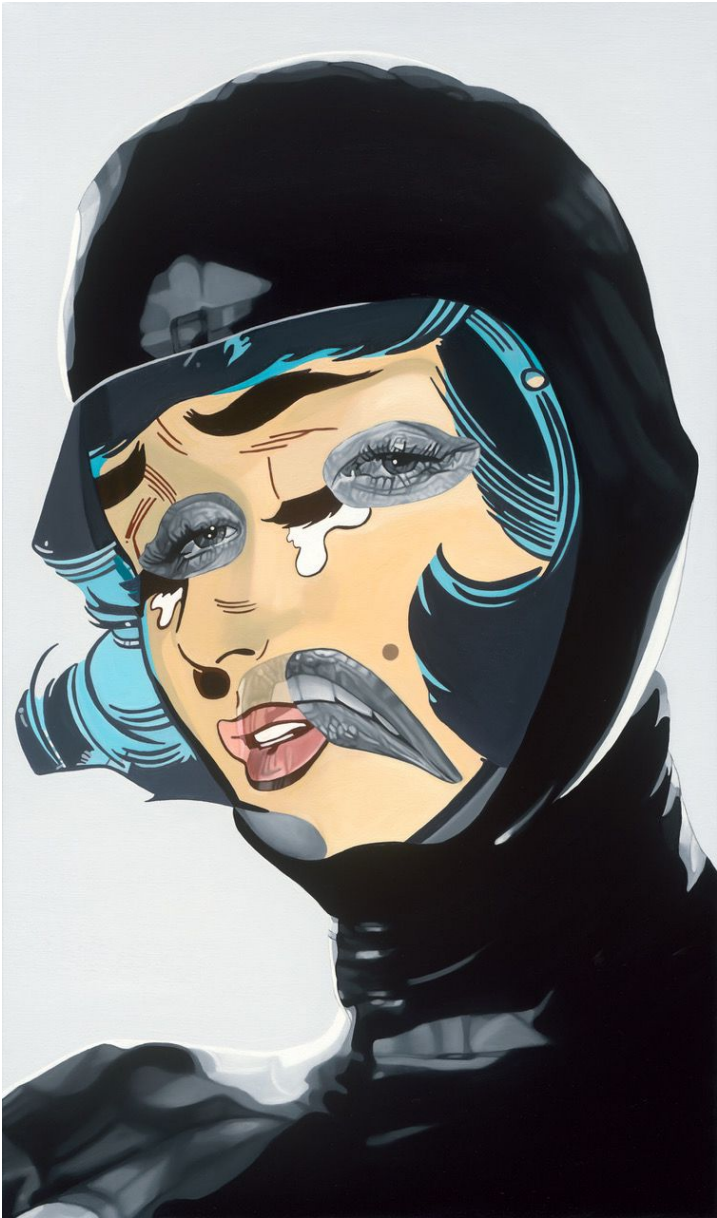
Teiji Hayama Comic Biker, 2024 Oil on canvas 53.25 x 31.5 inches