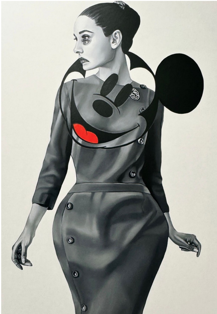
Teiji Hayama The Necklace, 2024 Oil on canvas 43.5 x 30.5 inches