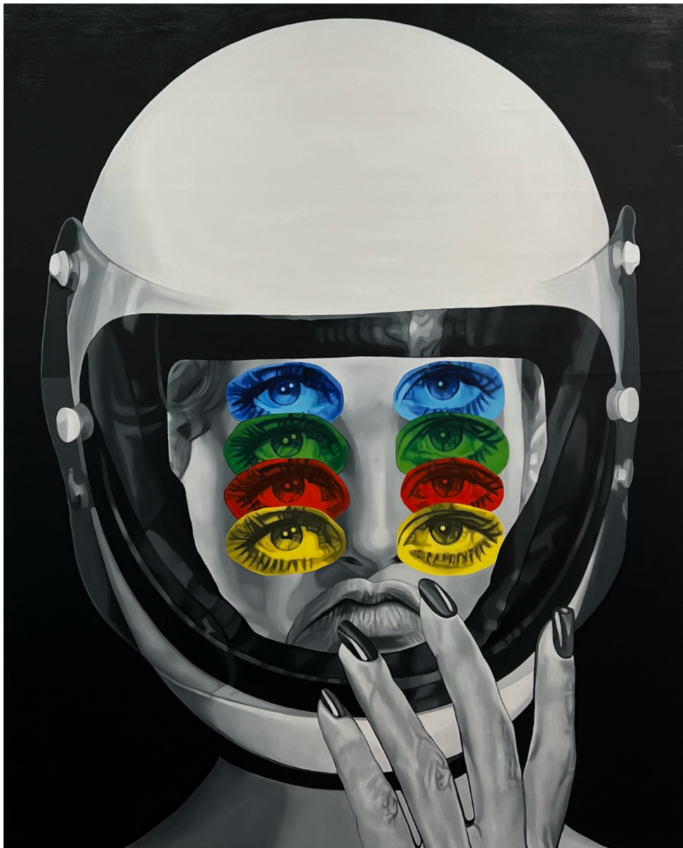
Teiji Hayama The Helmet, 2024 Oil on canvas 69 x 55 inches