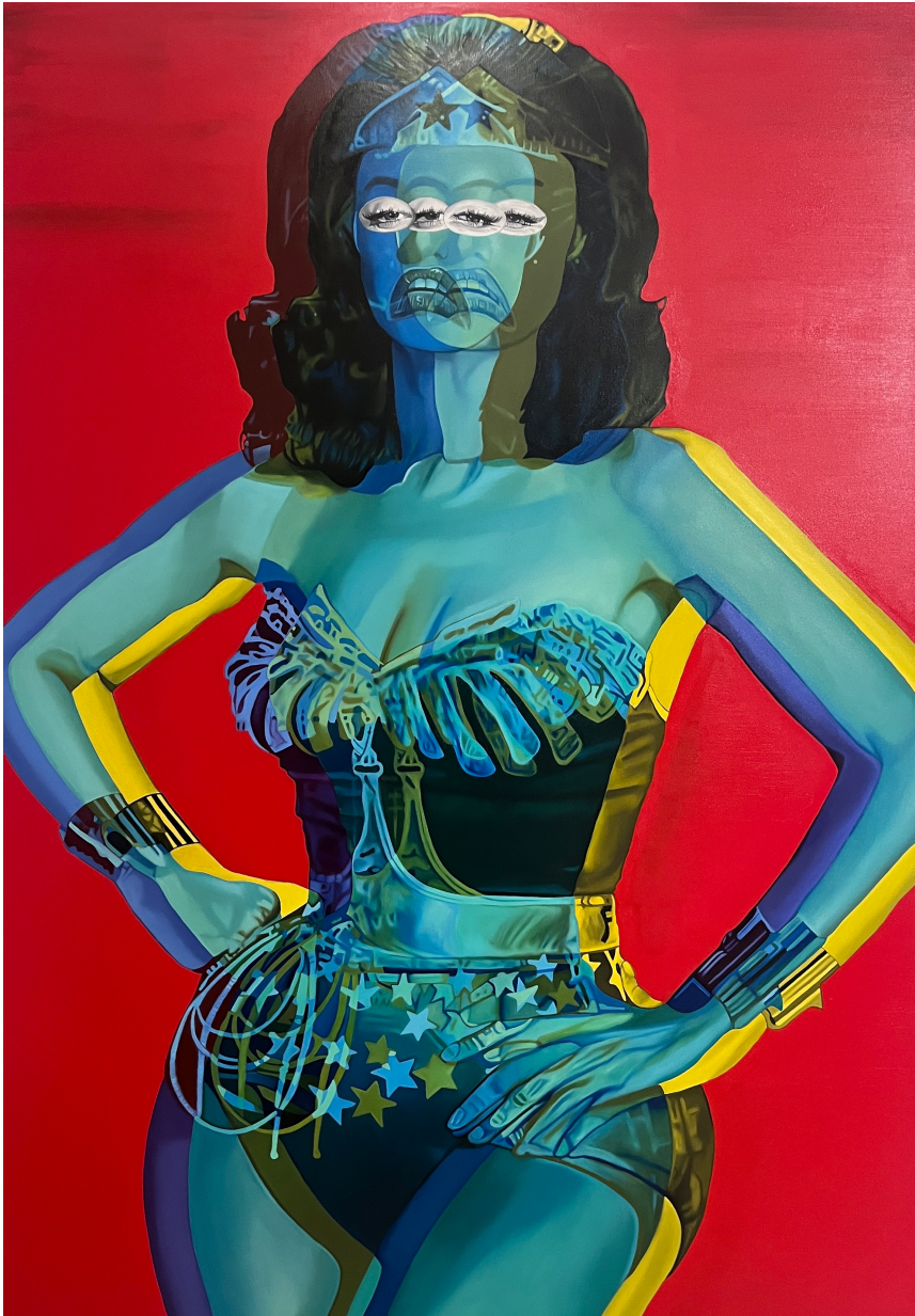
Teiji Hayama Wonder, 2024 Oil on canvas 59.25 x 41.5 inches