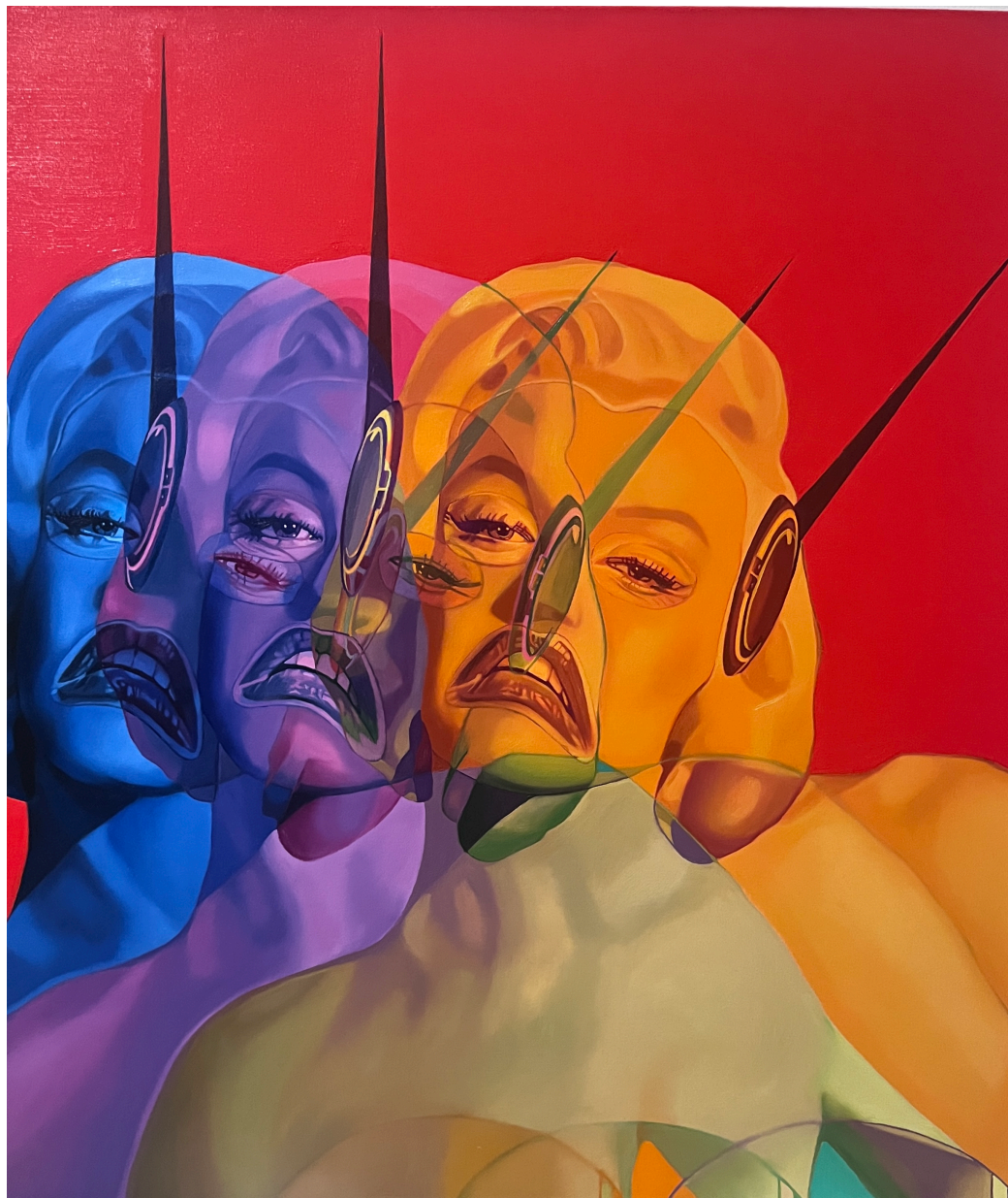
Teiji Hayama Triple Marilyn, 2024 Oil on canvas 27.75 x 23.75 inches