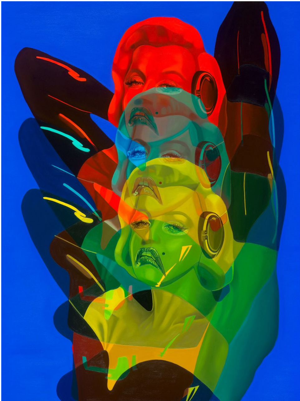
Teiji Hayama Disco Marilyn, 2024 Oil on canvas 57.25 x 43.5 inches